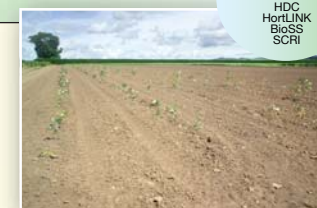
Figure 5: The new root rot trial established at SCRI

In summary, it has been noted that the areas on the linkage groups where the field results map to areas where resistance/susceptibility are known, need to be further saturated with SSR and AFLP markers, including another 96 progeny to enhance the map and reduce the confidence gap in these results, and investigate a whole range of germplasm to explore allele diversity. It is also interesting that early data on an earlier population, markers were also found to lie on Linkage Group I.