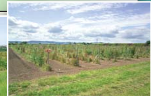
Figure 3: Moy x Latham Population at Infected site

To assist with accurate mapping of root rot resistance identified in glasshouse and field experiments, SSR's and EST-SSR's were developed and mapped