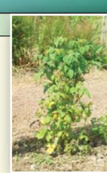
Figure 4: Latham (resistant) at infected site