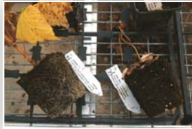
Figure 1: The roots of Glen Moy and Latham, where Glen Moy there is evidence of root rot; scale 5, and Latham roots are healthy and disease free; scale 0.

Replicates of the Moy x Latham mapping population were inoculated with two types of Phytophthora fragariae var. rubi . Plant data such as root density and damage on a scale of 0 to 5 (figure 1) were collected and analysed for significant differences.