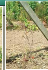
Glen Moy (susceptible) at infected site