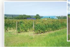
Figure 2: Moy x Latham population at uninfected site

The parents and the segregating population were planted and maintained at two environmental sites based at SCRI, one uninfected field (figure 2), and the other is heavily infested with Phytophthora fragariae var rubi (figure 3). Data was collected on plant health, growth, & viability and analyses of data for significant differences in all plant growth factors carried out.